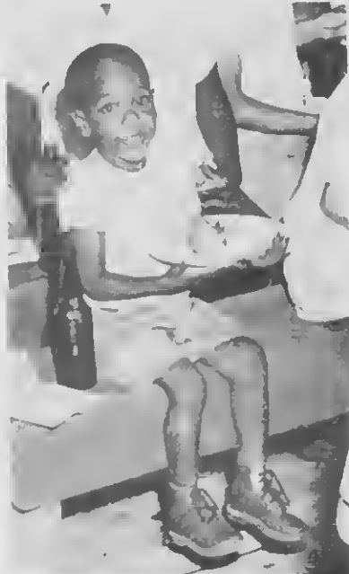
HERE IS THE first customer again, this time in action.